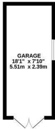
GROUND FLOOR 701 sq.ft. (65.1 sq.m.) approx.